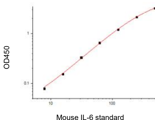
Figure1. Standard Curve of Mouse IL-6 in 96-well plate assay, data provided for demonstration purposes only. A new standard Curve must be generated for each assay.

Typical standard curve ( R^2 \geq 0.99 )