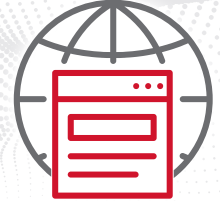
CASE-SHARING AND CONSULTATIONS